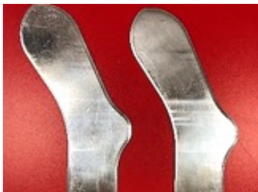
20° foot shape forms